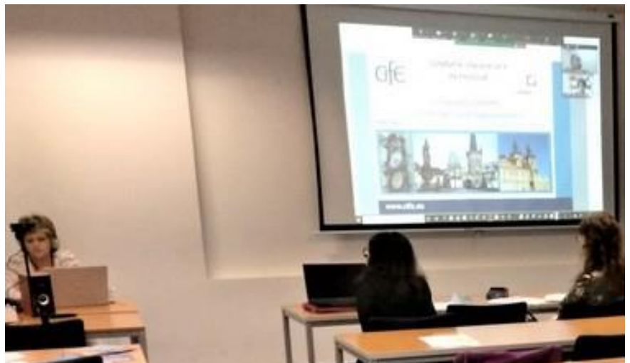
Presentation of the students

Director of the Summer university program of CIFE.